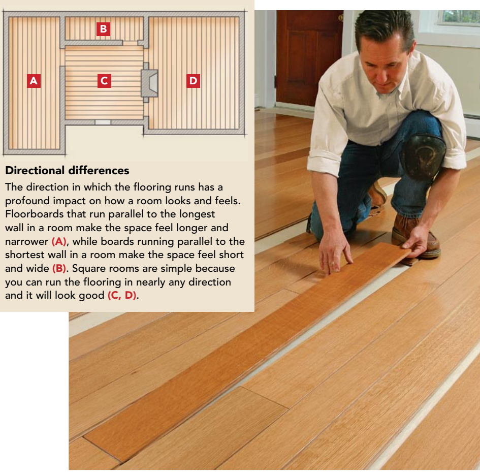
Rack it out. Lay out as much flooring as possible, but be sure to retain enough space for your flooring nailer. Racking gives you a preview of what the floor will look like. You'll notice boards with harsh, contrasting color tones or grain patterns right away, and you can refine how the boards break. Joints should be spaced at least three times the width of the flooring.

Figure out where to start the floor installation by finding the focal point of the room and working out from there. The focal point may be a window, a doorway, or in this case, a fireplace. Your eye is drawn to the focal point in the room, so you want maximum control over the length of boards in this area and the way they break. Notched, ripped, or tapered boards should be left for more inconspicuous areas.